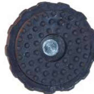
Rubber Pad Bottom View