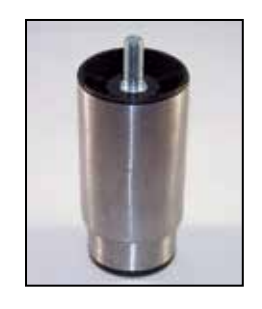
METAL — ADJUSTABLE LEGS

Adjustment = 3/4". Top of leg is 2-1/4" in diameter. Adjustable foot diameter is 1".