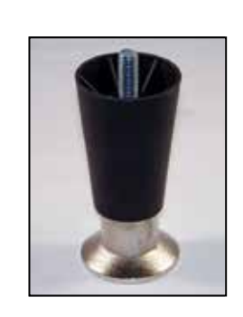
ABS PLASTIC — ADJUSTABLE LEGS